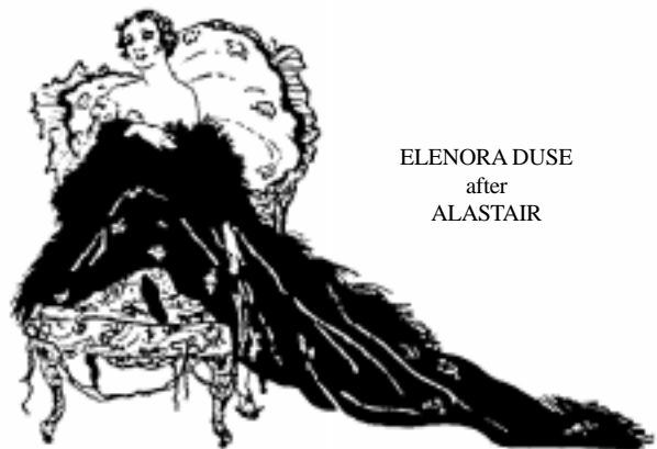
ELENORA DUSE after ALASTAIR